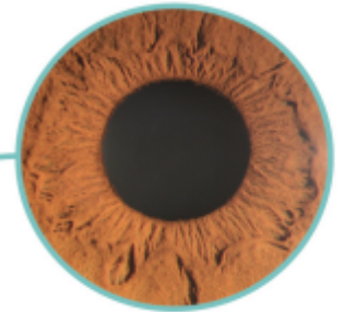
Clear and Stereoscopic View